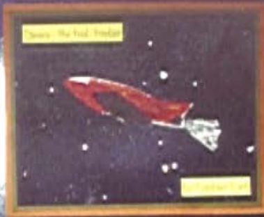
Space the Red Rocket